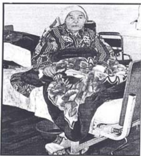
This elderly patient is happy to have a blanket in this chilly Kyrgyzstan hospital.

blankets and quilts. In many church circles, there are many delightful ladies who are experts at turning out quilts and blankets in great number to help the elderly and naked orphans pictured above.